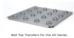
Ball Top Transfers for the AS Series